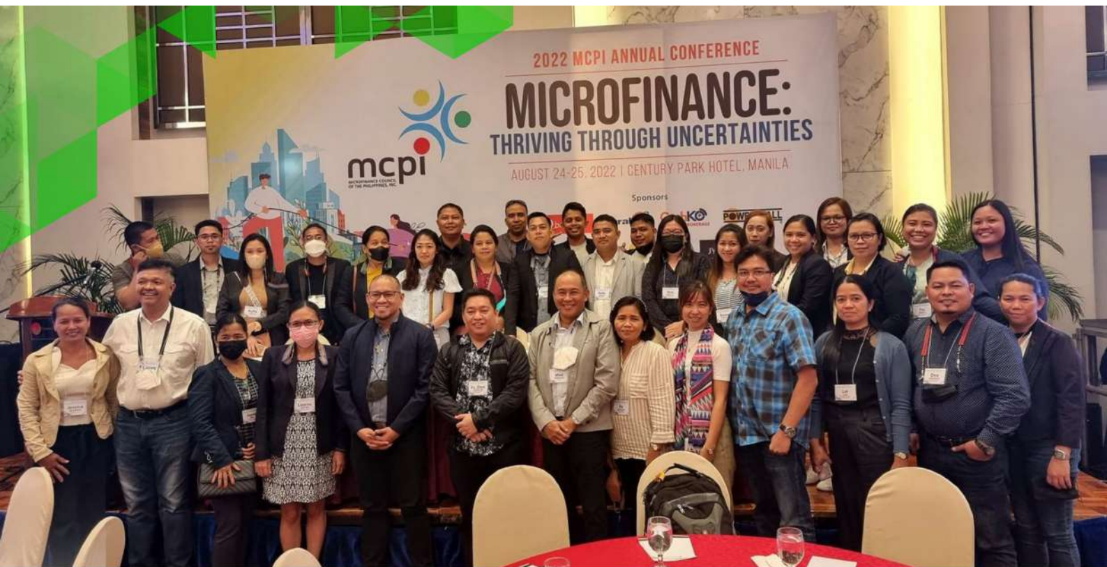
SEDP - Simbag sa Pag-Asenso, Inc. at the 2022 Microfinance Council of the Philippines, Inc. Annual Conference.